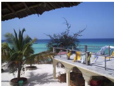
View from the hotel where I stayed - The Paradise Beach Hotel

In Zanzibar we visited the site of the former slave market, where the Anglican Cathedral is now situated. We also visited the site where slaves were kept after having been sold at the market prior to be shipped to the various countries.