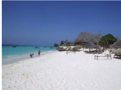
A view of the beach, Nungwi, Zanzibar

When you hear "Africa" you don't often think of beautiful sandy beaches and very blue water. Zanzibar is one of the most beautiful places I've ever seen and these photos provide some evidence of that.